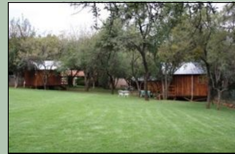
The Backpacker Lodge