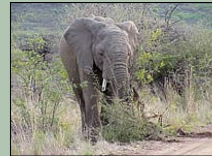
Elephant in the National Park, along with hundreds of other animals.

Visit: http://www.pilanesberg-game-reserve.co.za to check it out!