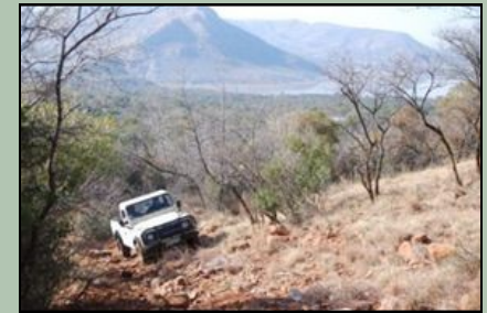
A Game Drive